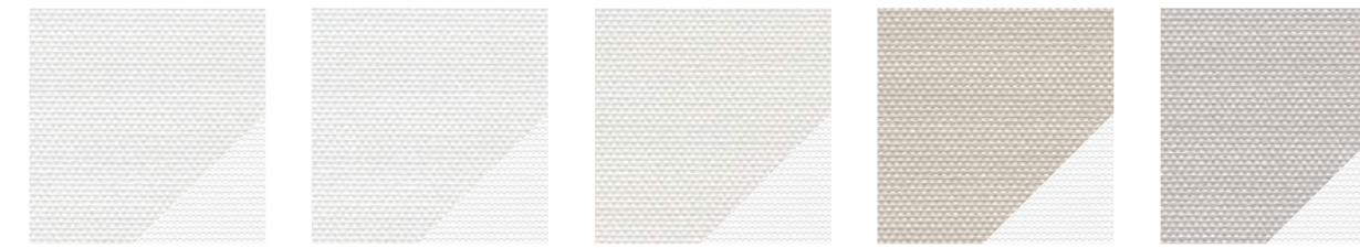
Dove White LF | BO